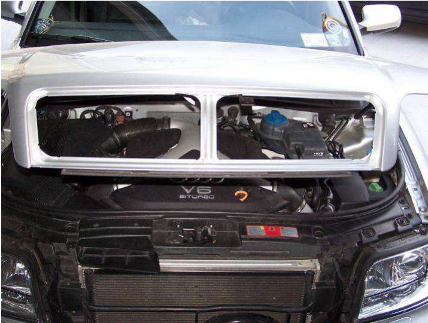
Comparison shot of 4.2 hood Notice the lower portion there is no metal where the grill mounts