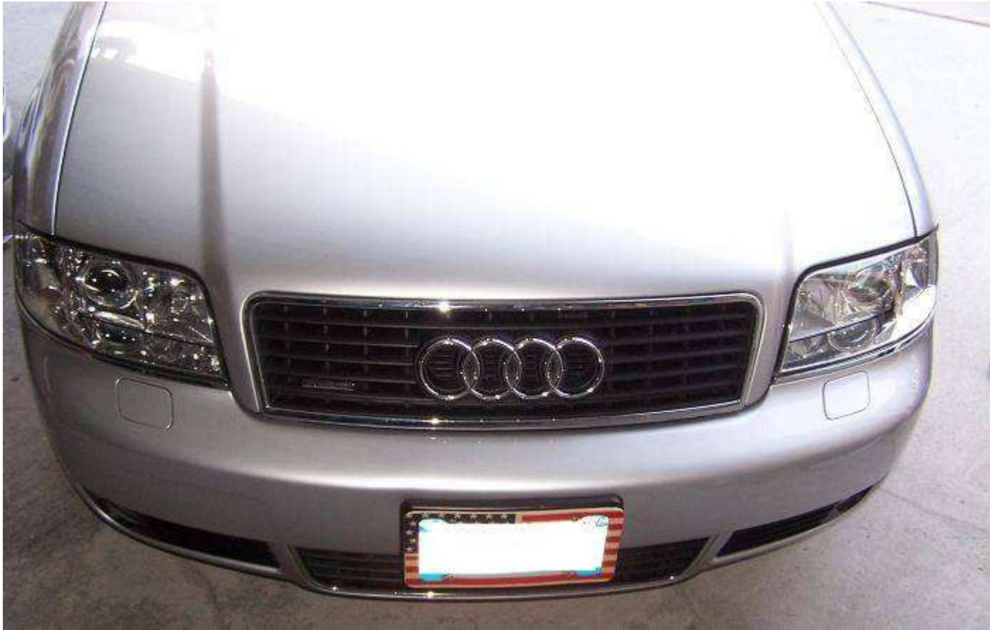
Comparison of the factory grill and the RS6