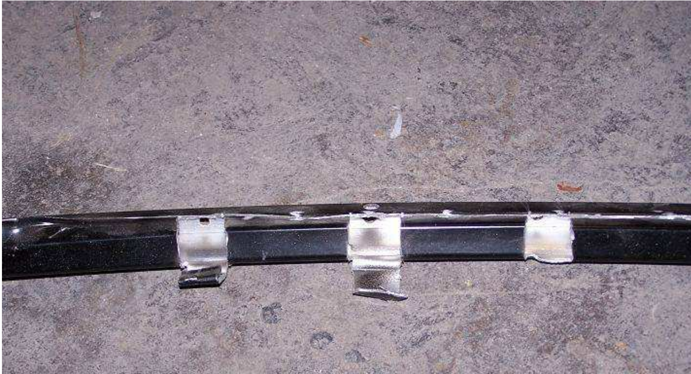
This is the factory grill. Notice that it uses plastic clips in order to secure it to the hood