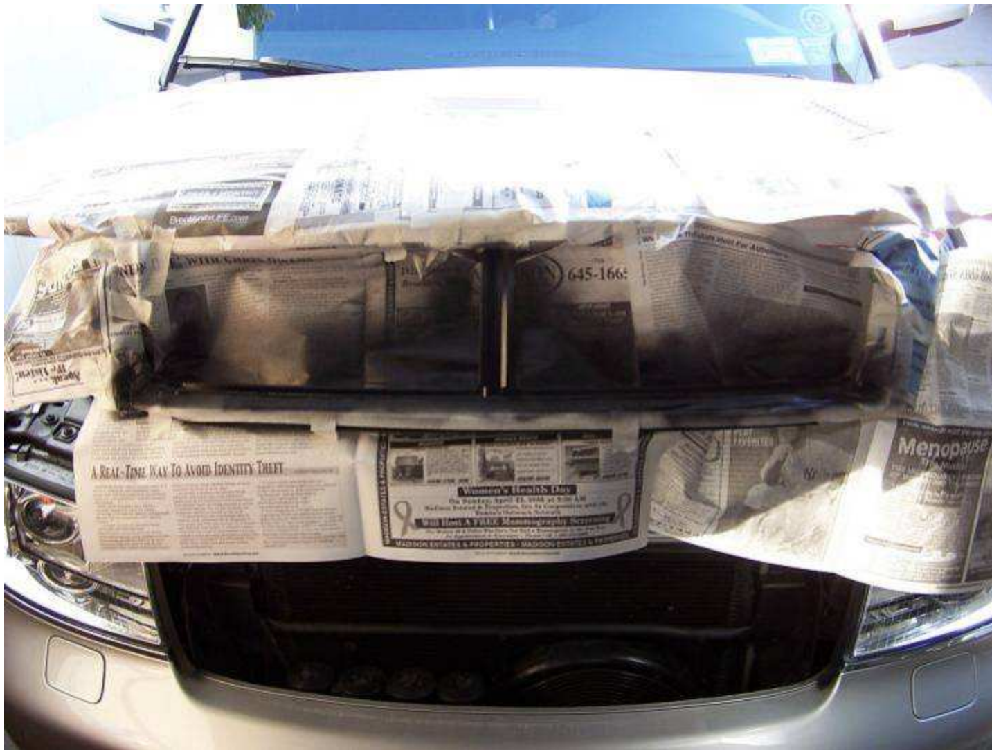
Again, a pic of the 'before' for comparison.