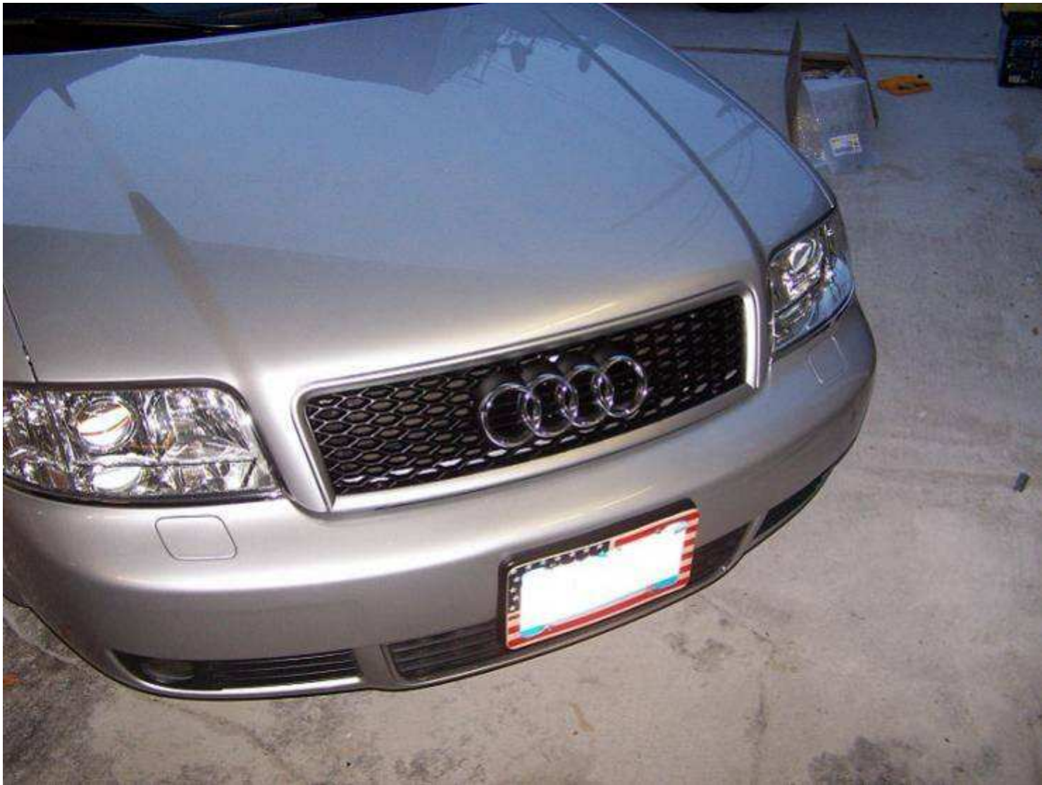
At this point I taped off the hood and painted the exposed areas.